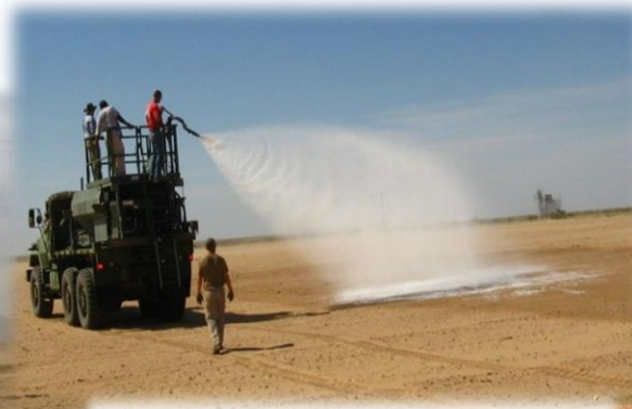
US Military world wide