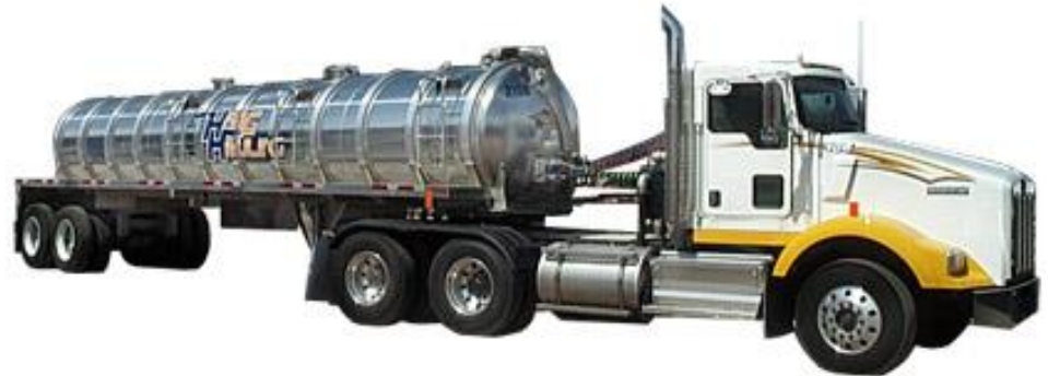
5,000-Gallon Bulk Truck (USA/Canada Only)