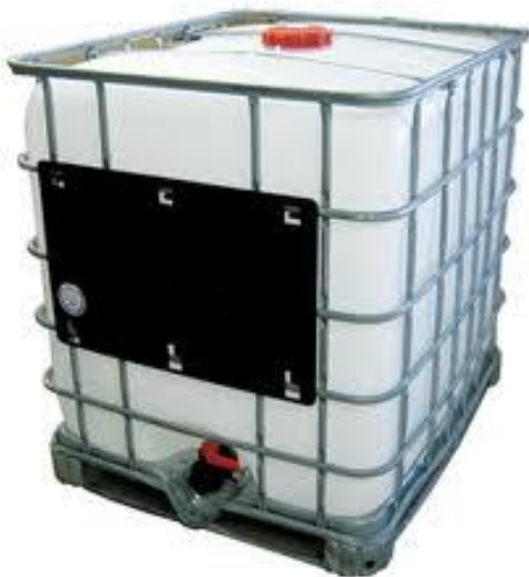
275 or 330 Gallon IBC Tote

Enviroseal is committed to supplying products at the best available pricing. We ship concentrated materials packaged in totes or bulk right to the jobsite.